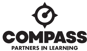
All Black on White